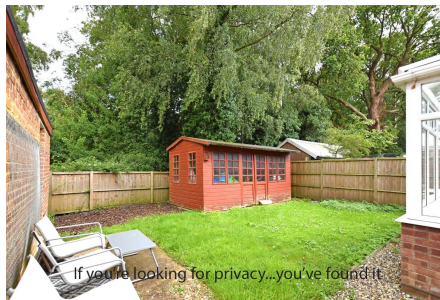
If you're looking for privacy...you've found it