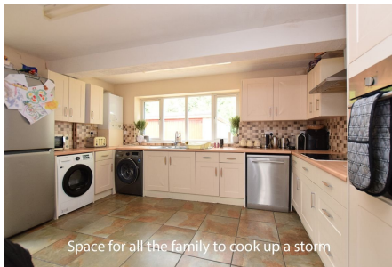
Space for all the family to cook up a storm